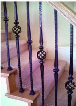
Quicker trim cuts and blade savings compared to working with solid bar balusters