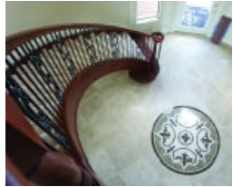
Lighter for easier handling in the field