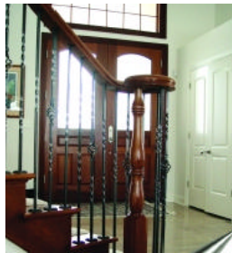
Cheaper freight costs verses solid bar balusters