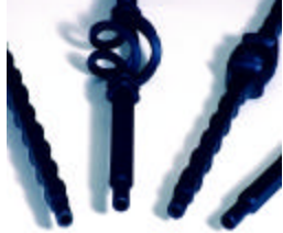
Strength in the baluster using tubular steel